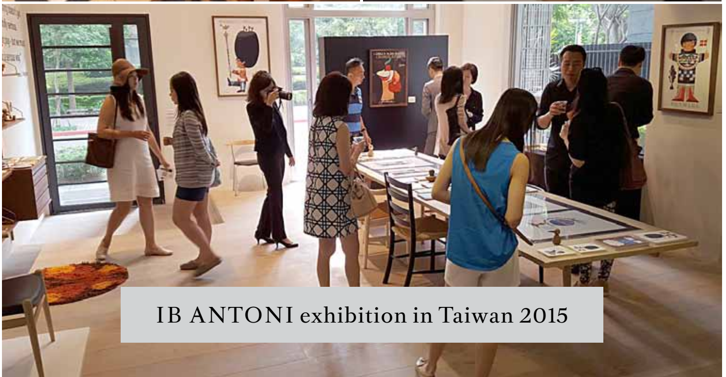
IB ANTONI exhibition in Taiwan 2015